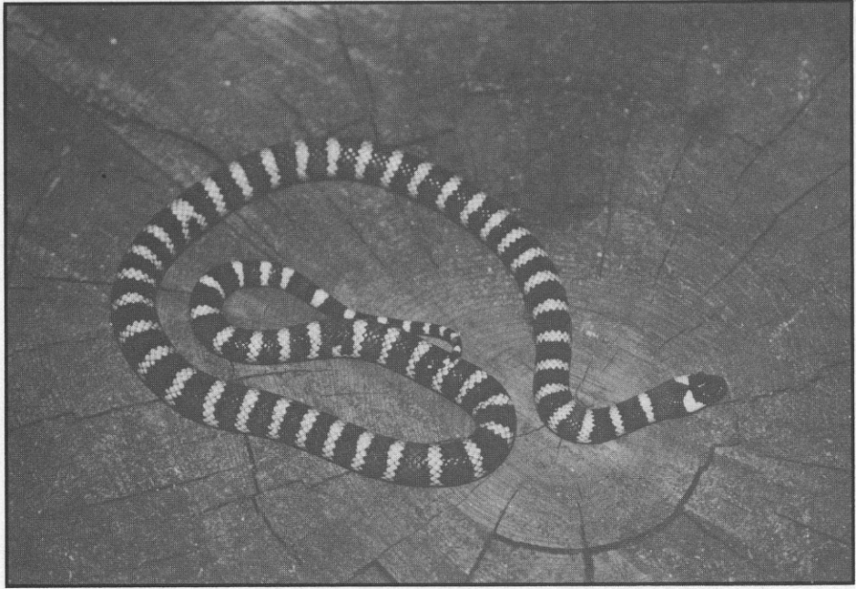
Brightly-colored Gray-Banded Kingsnakes are not as commonly seen as other tri-colored Kingsnakes.